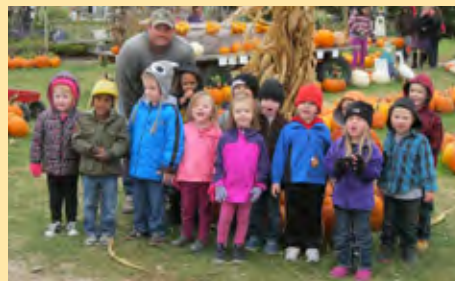
MISD preschools include Bright Beginnings and Apple Kids. Preschool class field trips this year have included the apple orchard, pumpkin patch, Indian Creek Nature Center and Wickiup Hill.

Starry students celebrated beloved children's author, Theodore Seuss Geisel's birthday in March during a week-long event aimed at highlighting the importance and fun of reading. Daily themes were based on five Dr. Seuss books – like crazy socks day to tie with Fox in Socks and students wore fun hats and teachers dressed like Thing 1 and Thing 2 to tie with The Cat in the Hat . A school-wide assembly was held with guessing games, skits and songs.