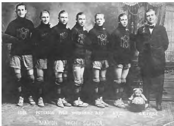
Marion High School 1912-13 varsity boys basketball team.