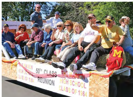
MHS class of 1964 celebrate their 50 th class reunion during the Swamp Fox Festival in September 2014.