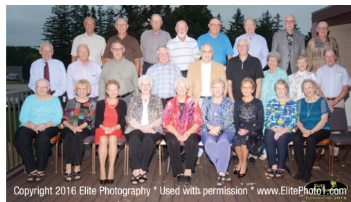
Members from the MHS class of 1956 celebrate their 60 th class reunion in 2016.