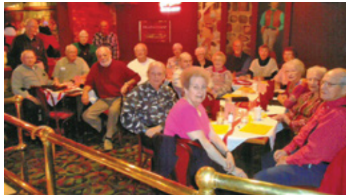
Members from the MHS class of 1950 celebrate their 65 th class reunion in September 2015.

Reunion plans are under way for several classes. For additional details, visit www.Marion-Foundation.org or check for a class Facebook page. To schedule school tours, contact your reunion representative. The Foundation will assist with coordinating tours of the high school/middle school when possible. Also, don't forget the City's annual Swamp Fox Festival celebration is scheduled for Saturday, September 24. For additional details, visit www.cityofmarion.org .