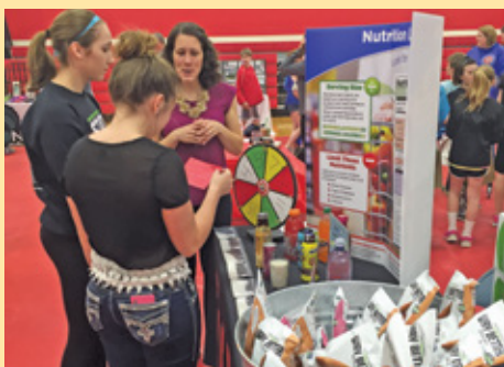
The Marion High School physical education staff along with school health services personnel sponsored a Health Fair on April 15. The annual event promotes healthy choices for Marion students, staff and members of the Marion community. More than 45 exhibitors provided information and interactive displays related to injuries, nutrition, exercise, disease prevention, personal fitness/equipment and careers.