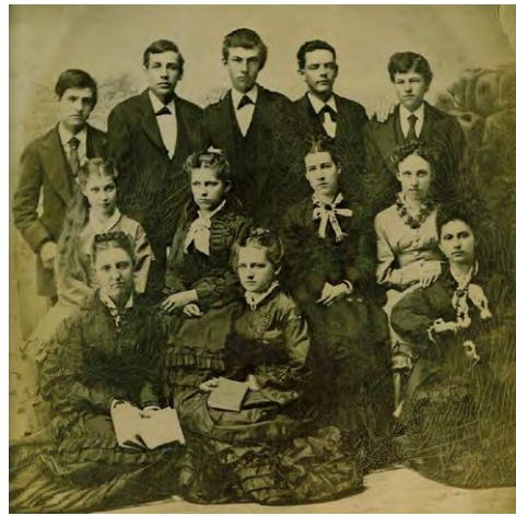
Marion High School class of 1875.