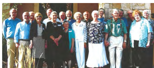
MHS Class of 1953 together for their 65th class reunion.