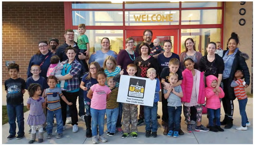
Families participating in this fall's FAST at Longfellow Elementary during their last night of the program.