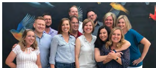
Members of MHS Class of 1998 in the Uptown Marion alleyway.