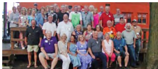
MHS Class of 1973 gather at the caboose for a group picture.