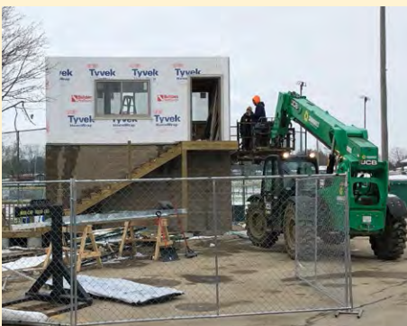
Crews have sectioned off part of the high school parking lot for construction of the new press boxes. Work is quickly wrapping up on the baseball, softball, and soccer press boxes before the Iowa winter sets in.

Dump trucks have hauled away outdated equipment and structures while contractors and the district’s maintenance team are working hard to complete a list of updates to the Marion High School Auditorium and Les Hipple Athletic Complex.