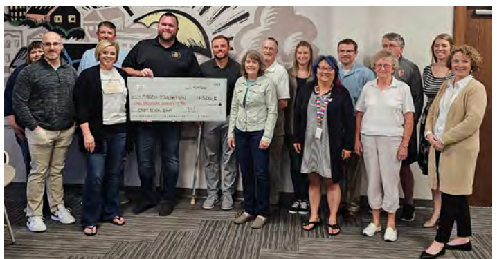
Iowa Giving Crew members stopped by the Foundation's April board meeting to present a check for $5,000 to the Start School Right program. Iowa Giving Crew was formed in 2017 by a group of friends who have worked to raise and direct funds to those in need throughout the Cedar Rapids/Marion area.

A generous grant through the Marion Foundation from Green State Credit Union provides food and activities for the picnic event and throughout the school year.