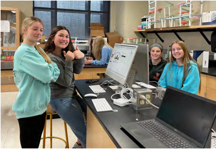
High schoolers in the AMPED class give a thumbs-up for computer purchases made through the 2023 Grants program.

Each year the Marion Foundation Grant Program provides teachers and staff an opportunity to apply for grant-funding to support projects that benefit students in the Marion Independent School District. More than $35,000 in grants was awarded in April through this program.