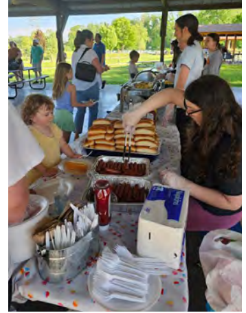
Volunteers help serve food and beverages during the FASTWorks year-end picnic.